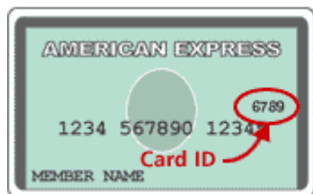
American Express: 4 digits on front of card

Due to the amount of credit card fraud over the internet, banks increasingly require this information to process credit card orders online. Your benefit is that it prevents any fraudulent charges using your credit card, i.e. no one can pick up an old receipt of yours and use that info to fraudulently use your credit card.